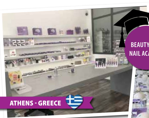
ATHENS - GREECE