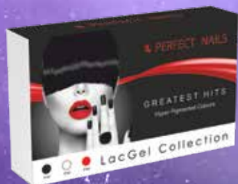
Greatest Hits LacGel Collection kit | PNKG018

Use LacGel Plus #+057 or the black shade of our Greatest Hits collection: Mystic Night LacGel #181.