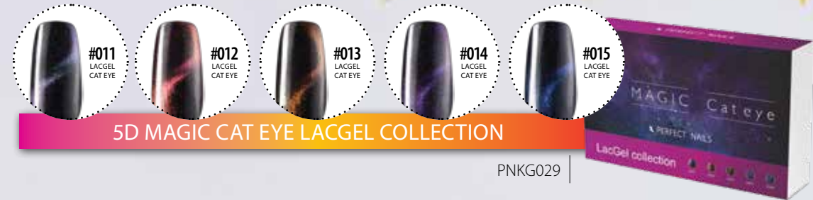
5D MAGIC CAT EYE LACGEL COLLECTION

Fabulous colored glass effect and multi-dimensional shades that quickly became client favorites.