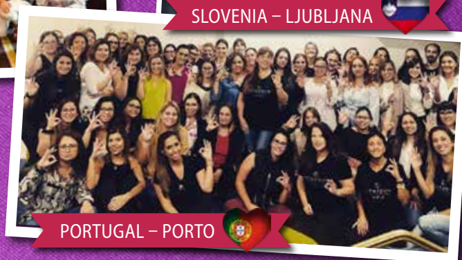
PORTUGAL – PORTO