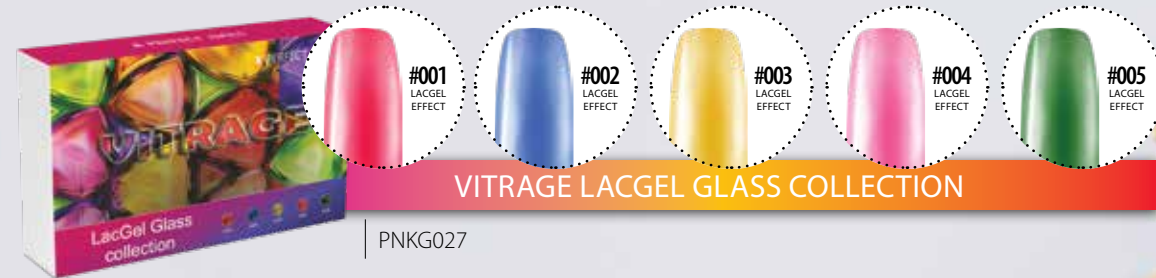
VITRAGE LACGEL GLASS COLLECTION