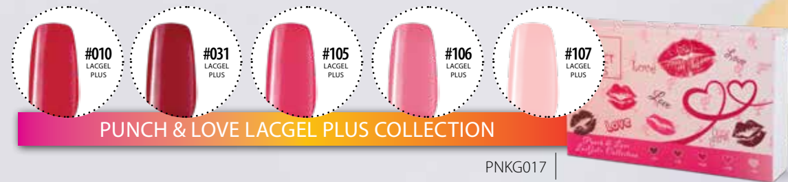
PUNCH & LOVE LACGEL PLUS COLLECTION