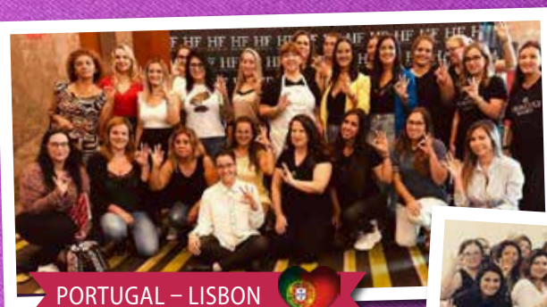
PORTUGAL – LISBON