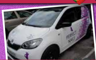
SLOVENIA – LJUBLJANA