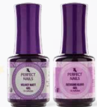
PNZ6047 | 15 ml | PNZ6045

Matte or shiny top coats that guarantee a beautiful result.