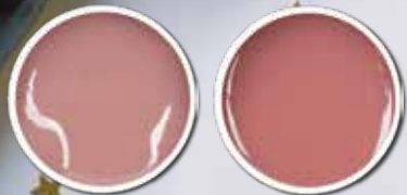
PNZ098 | 15 g | PNZ100 PNZ099 | 50 g | PNZ101