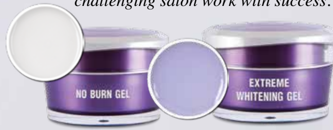
PNZ102 | 15 g | PNZ096 PNZ103 | 50 g | PNZ097