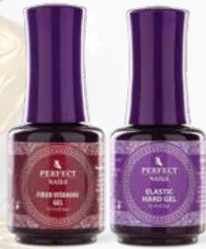
PNZ090 | 15 ml | PNZ059

Enjoy working on a perfectly prepped base, and provide even more durable nails for your clients.