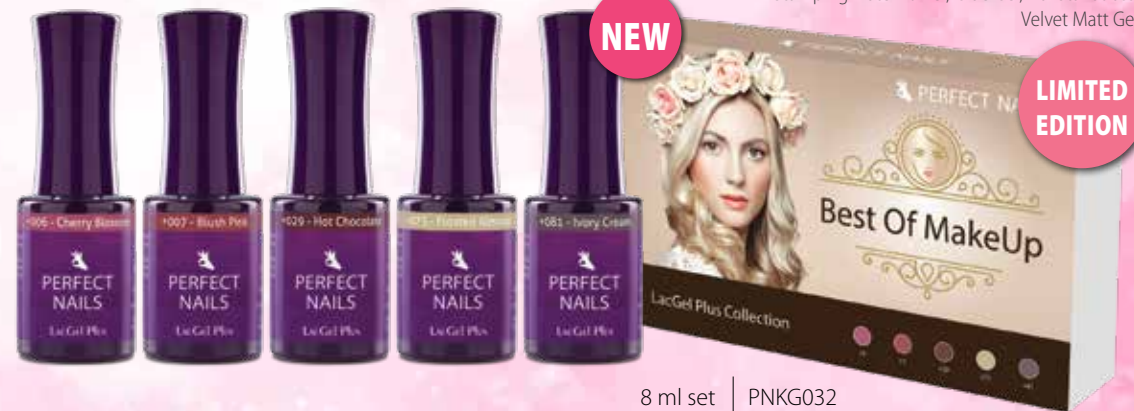
8 ml set | PNKG032

Best of MakeUp LacGel Plus Collection, Stamping Nail Polish White, Stamping Plate Flower, Glue Gel, NailStar Strass, Velvet Matt Gel