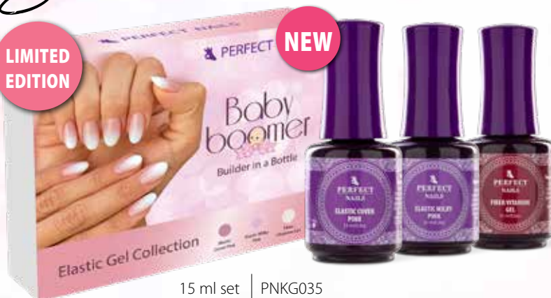
15 ml set | PNKG035