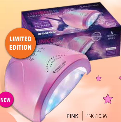
PINK | PNG1036