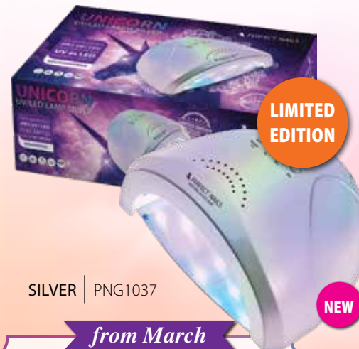
SILVER | PNG1037

Universal 48 Watt UV/LED lamp with a holographic surface available in 2 main colors. These lamps feature 30 energy-saving LEDs and their sensors are placed lower in order to enable perfect curing on the thumb as well. The magnetized base of the lamp has a mirror surface and it is detachable.